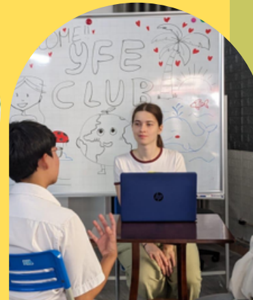
Youth for Earth Club recruitment