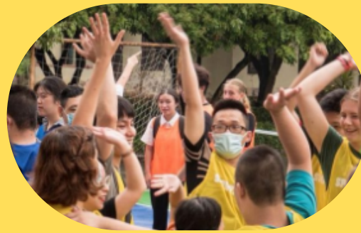
activities for the youth and raising climate awareness