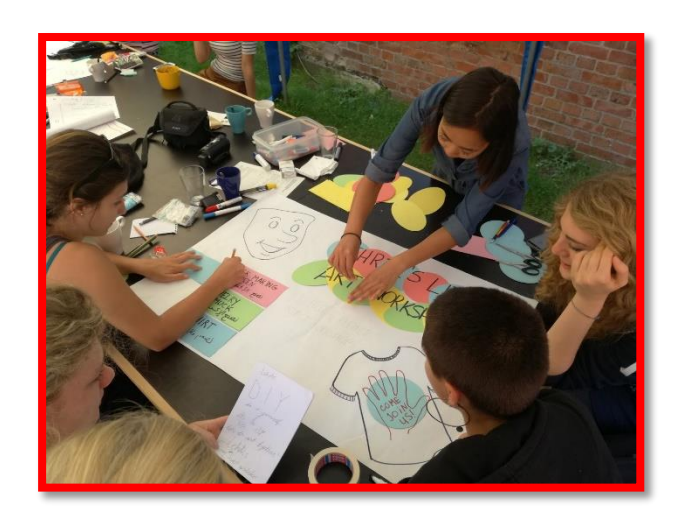
Day 5 – Friday, August 19<sup>th</sup> Morning

After the break, we were divided into five groups and each group with a topic of discussion, the five topics were, poverty, political (persecution), climate change, war (violent, conflict), and unfair terms of trade. She also gave examples to each group to follow while discussing, and we should also add any one we know of to the discussion and find the reasons, examples and the solutions to them all. Afterwards we came back together and submitted our points and she talk about them and also gave her opinions. After a short summary and final evaluation which was very positive the work of the day was finished.